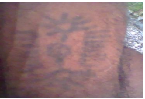
Figure 7 Lunat Pika Bu'ufon right hand Photo of Mr.Jusak Beti

7) Lunat Pika Bu'uf (Tattoo of Plate's Bottom)