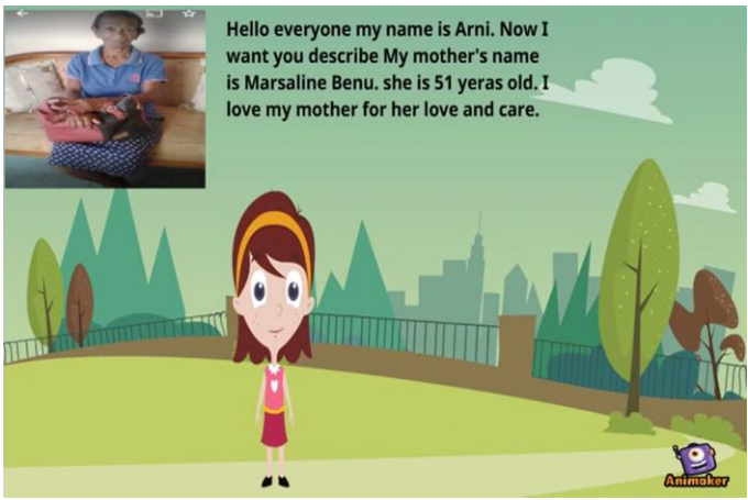
Figure 1. Writing goal stated in the text

The first aspect of DST is well-achieved by half of the students. These students are able to clearly state the topic on their animated video. Another half of them do not obviously state their topic on their video. However, viewers can still understand the topic from the image of parent the students inserted on the first slide of their video.