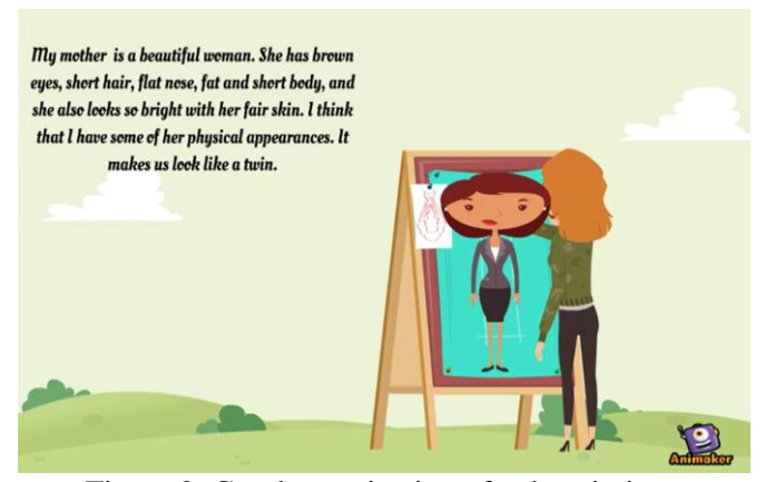
Figure 2. Good organization of a description

Organization as the fifth aspect of DST carries the way how the text is delivered logically. The structure of writing assessed on the animated video is one of descriptive text. A good descriptive text is organized commonly by having these two structures; Identification and Description. The skill to organize the structure of the descriptive text was successfully achieved by few of the students. They also can manage each of their main ideas with well-composed sentences where they can provide supporting ideas to each of the main idea. Figure 2 is an example of Animaker animated video with good organization.