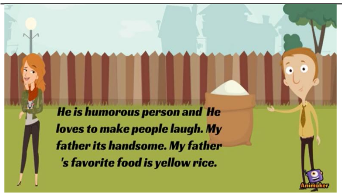
Figure 3. Poor organization of a description

In Figure 3, the text writer cannot express ideas in coherent sentences. The second and third sentences are not related to the ideas contained in the main sentence. The word 'humorous' should be clarified by giving examples of action or more detailed language expressions. Unfortunately, the phrase 'My father is handsome' and 'My father's favorite food is yellow rice' in the sentences following do not match the main idea in the initial sentence. Each one better describes the physical appearance and preferences of the person described.