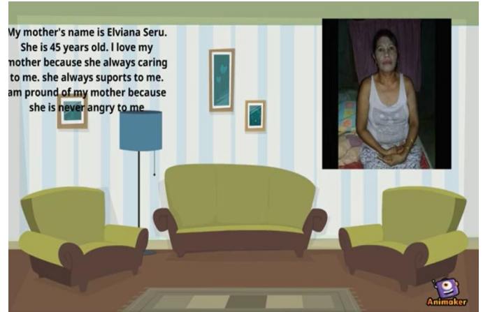
Figure 4. Mechanics problems in a student's part of text

Good mechanic of writing which becomes the eighth aspect of DST requires no error in spelling and grammar. Most students have problems in this aspect. Other technical problems of writing are relating to capitalization, spacing, and punctuations. Figure 4 is one example of bad mechanics carrying several writing mistakes.