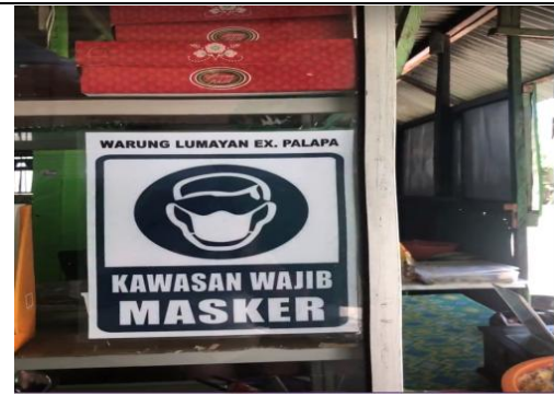
Figure 2. Mask Required Area on Lala Mentik Street

The Location of the Windshield of the Warung is not bad. The research data in figure 2 above shows several things, including: