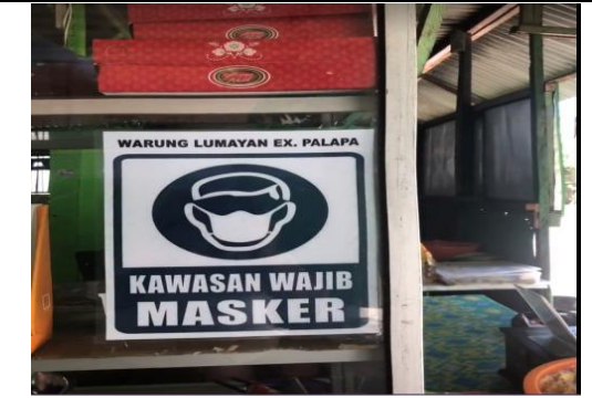
Figure 2. Mask Required Area on Lala Mentik Street

The Location of the Windshield of the Warung is not bad. The research data in figure 2 above shows several things, including: